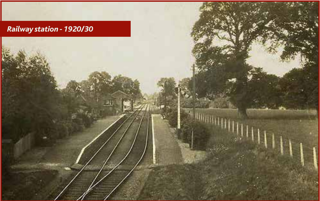
Railway station - 1920/30

Alas, the railway line was a victim of the Beeching Cuts in the 1960s, and the line closed. Whilst some at the time criticised the decision to close the line, Beeching claimed that as the line had yet to be finished, it was not operating efficiently. The area which was the station and goods yard, is now Viscount Court, the business estate at the south of the Parish. The old bridges and foot prints of the tracks are still visible today between Curbridge and Brize Norton.