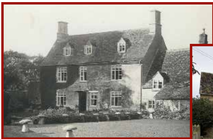
Marsh Haddon + Upper Haddon Farms

Marsh Haddon was actually two hamlets combined into one. Found to the south of the village, Marsh Haddon has its roots in Anglo-Saxon times like the other settlements in the local area. 'Marsh' referred to an area of common land and 'Haddon' means "uncultivated hill slope". Although Marsh Haddon was linked to Brize Norton, and Lower Haddon was linked to Bampton, they were finally combined in the 16th century into one manorial estate. In 1937, much of Marsh Haddon's land was acquired by the MOD and levelled. Marsh Haddon and its adjoining cottages were demolished in 1943 to make way for a new runway extension.