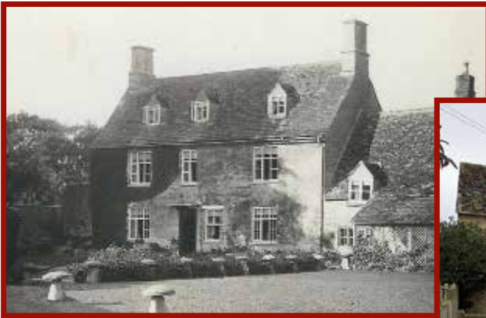
Marsh Haddon + Upper Haddon Farms

Marsh Haddon was actually two hamlets combined into one. Found to the south of the village, Marsh Haddon has its roots in Anglo-Saxon times like the other settlements in the local area. 'Marsh' referred to an area of common land and 'Haddon' means "uncultivated hill slope". Although Marsh Haddon was linked to Brize Norton, and Lower Haddon was linked to Bampton, they were finally combined in the 16th century into one manorial estate. In 1937, much of Marsh Haddon's land was acquired by the MOD and levelled. Marsh Haddon and its adjoining cottages were demolished in 1943 to make way for a new runway extension.