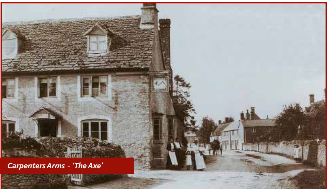
Carpenters Arms - 'The Axe'

The Masons Arms in Burford Road and the Chequers in Station Road (north), are the last two surviving and working public houses. The Chequers is first recorded in 1774 and was used to hold numerous meetings and auctions in the village. In 1881, The Masons Arms was opened by Thomas Akers, a renowned beer seller of the time. The Axe and Compass in Station Road (south) was first recorded in 1782 but it was renamed The Carpenters Arms in 1846, although it was still known locally as "The Axe". It also held meetings and auctions. It became a B&B in 1991 and the long adjoining building running northwards, which was the original skittle alley, is now used as a separate dwelling.